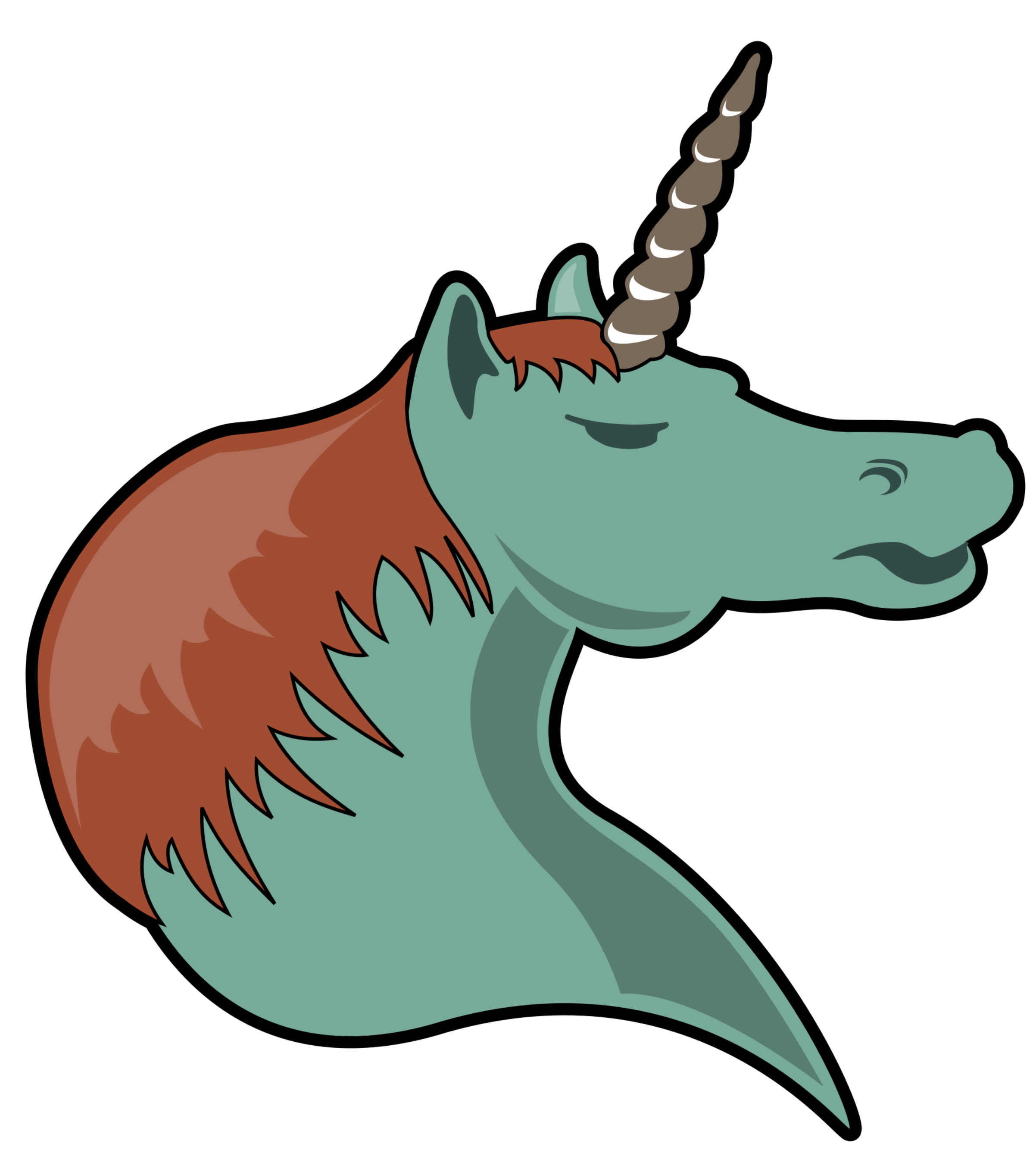
Figure 1: This could be a figure.